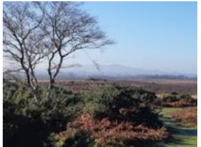
January morning on the heath.