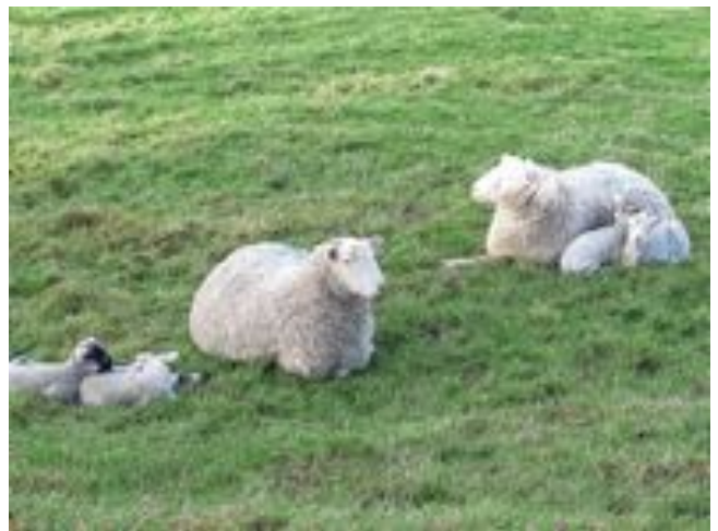
Purbeck sheep and lambs.

We know that many people support the ambition to ensure that Dorset's very special environment, wildlife and heritage will be cared for, for future generations. We welcome the government's proposal to help make National Parks even better places to live in and visit by giving National Park Partnerships, working with local authorities, increased powers to help manage visitor pressures, including traffic.